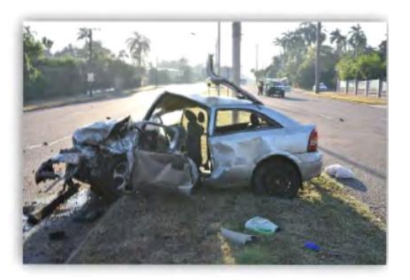
Figure 16: Passenger's side of Holden.