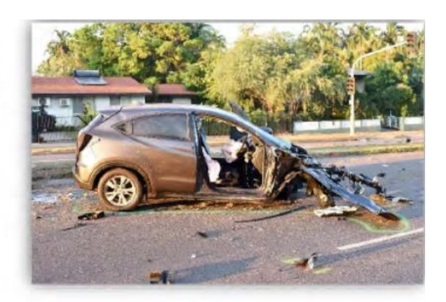
Figure 18: Driver's side of Honda.