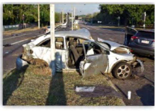
Figure 14: Driver's side of Holden.