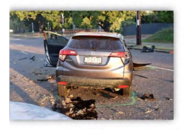
Figure 19: Rear of Honda.