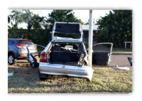
Figure 15: Rear of Holden.