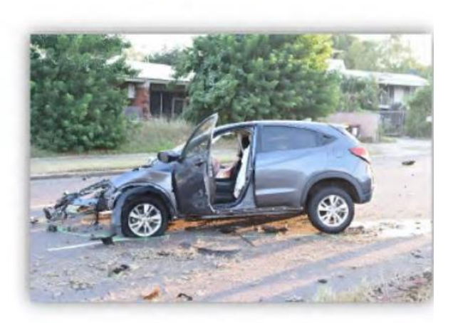
Figure 20: Passenger's side of Honda.

25. The Astra rotated in a counter-clockwise direction and struck a traffic light which caused its rotation to reverse. It side swiped a light pole and stopped on the median strip. The course of its travel is depicted in the reconstruction photo below and the damage to the Astra is depicted in the further photos.