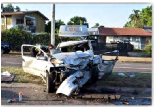
Figure 13: Front of Holden.