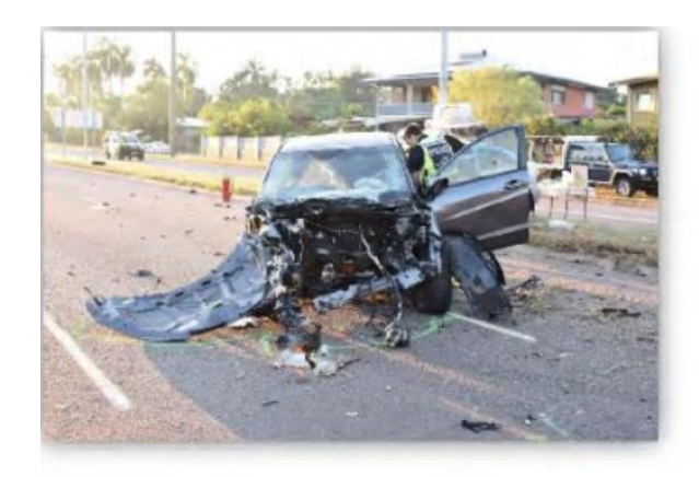
Figure 17: Front of Honda.