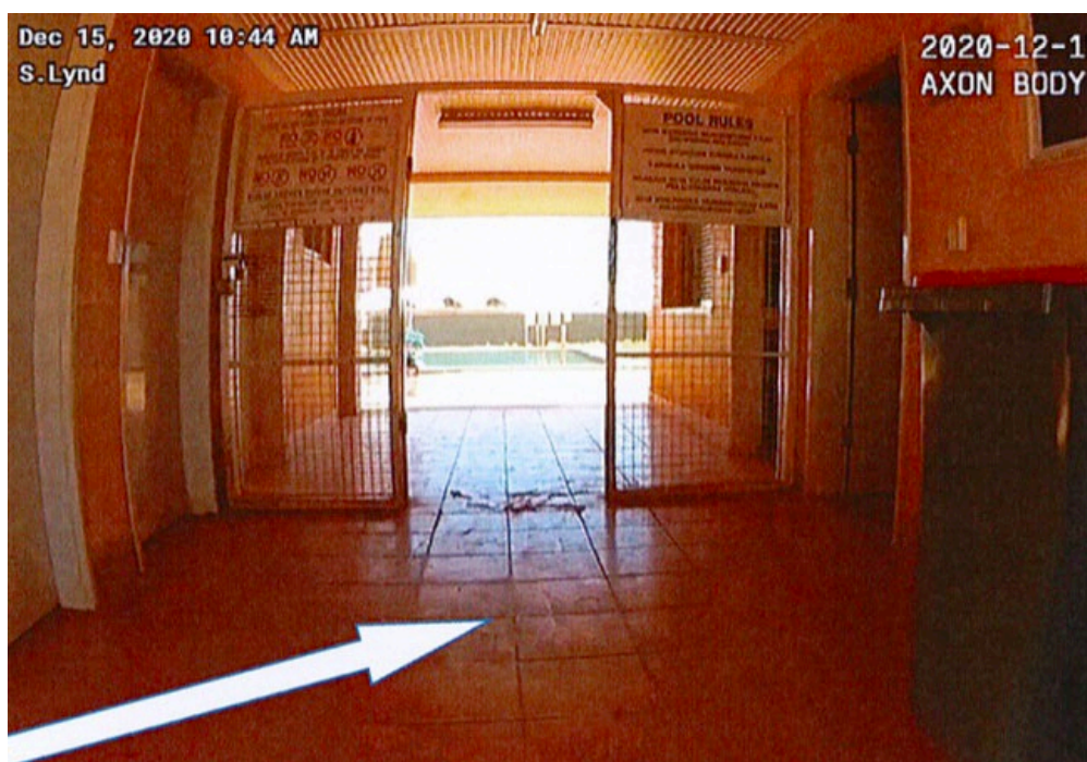
Photo 1 - the vestibule area where the children were changed into swimming clothes/nappies

area marked G1 on the above diagram and depicted in the photo below) 26 and then they all made their way down to the toddler pool.