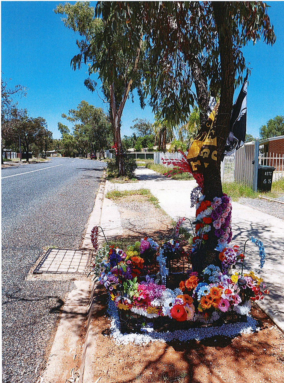
The family placed a memorial at the third tree.