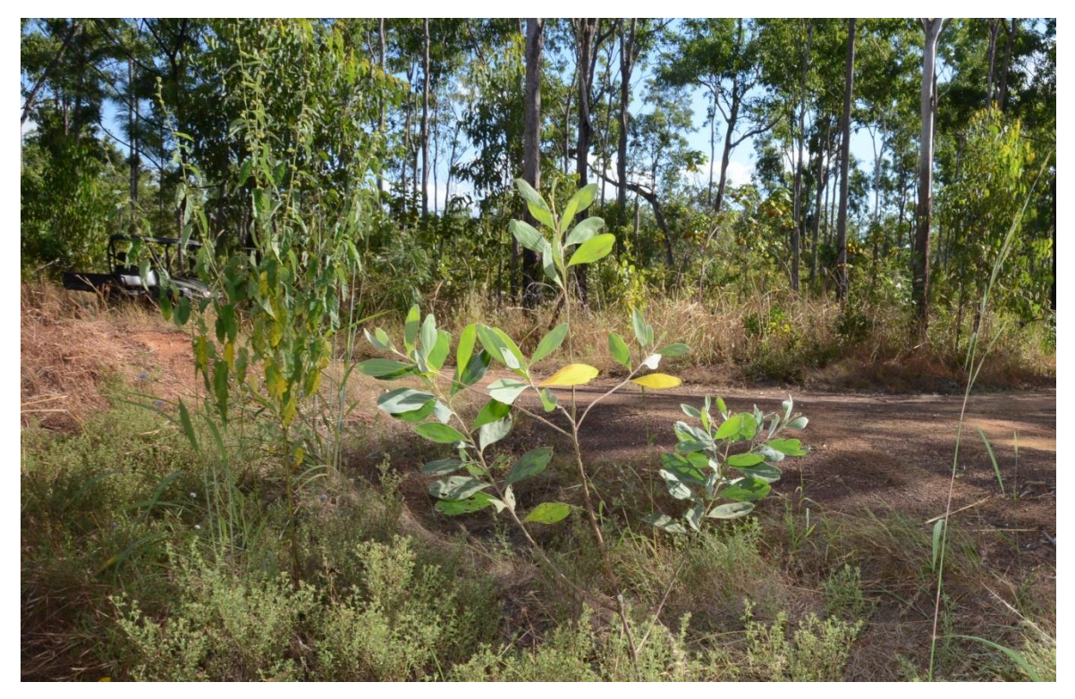
Photo showing mound on the left, now visible, with Polaris on its wheels in the background.

21. When Benny hit the ground it is likely that he suffered an atlanto-occipital dislocation fracture (separation of the spinal cord from the base of the skull) and moments later the Polaris landed on him, crushing his skull.