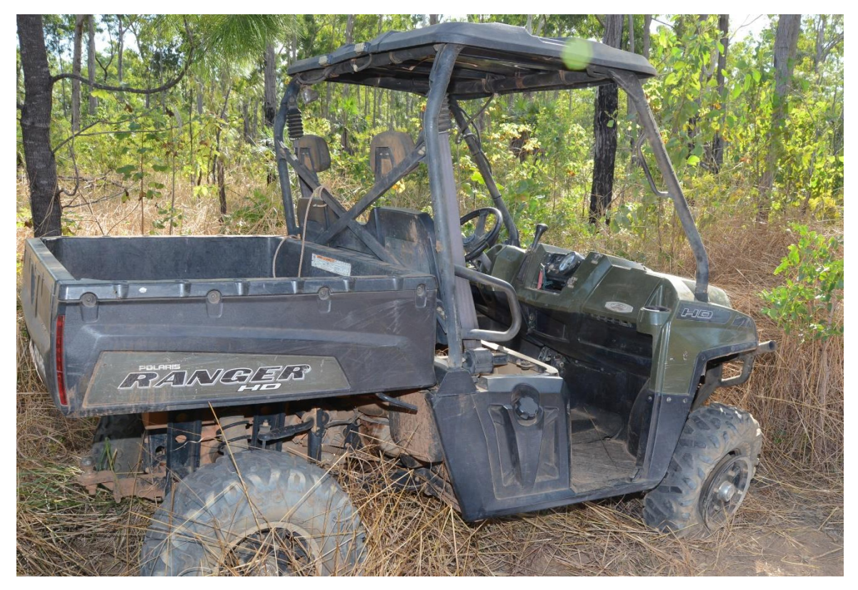
Polaris ATV near where it landed on its wheels (after it was lifted off the deceased).

21. When Benny hit the ground it is likely that he suffered an atlanto-occipital dislocation fracture (separation of the spinal cord from the base of the skull) and moments later the Polaris landed on him, crushing his skull.