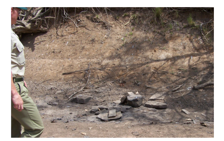
Rocks found in waterhole at the location of the body

59. Considering the discovery of large rocks in the young boy's shorts, and the time taken for the body to surface, it is in my view well within possibility that the rocks found under the body were used to weigh down the torso. I heard evidence that as the body decomposed it would bloat. Bloating could cause rocks placed on top of the torso to dislodge. Once dislodged, the upper body would become free to float. But the lower body remained weighed down by the rocks contained within the shorts. This reasoning would explain why the body did not float for two days, and why only the upper half was floating when it was discovered. It is also highly suggestive of foul play.